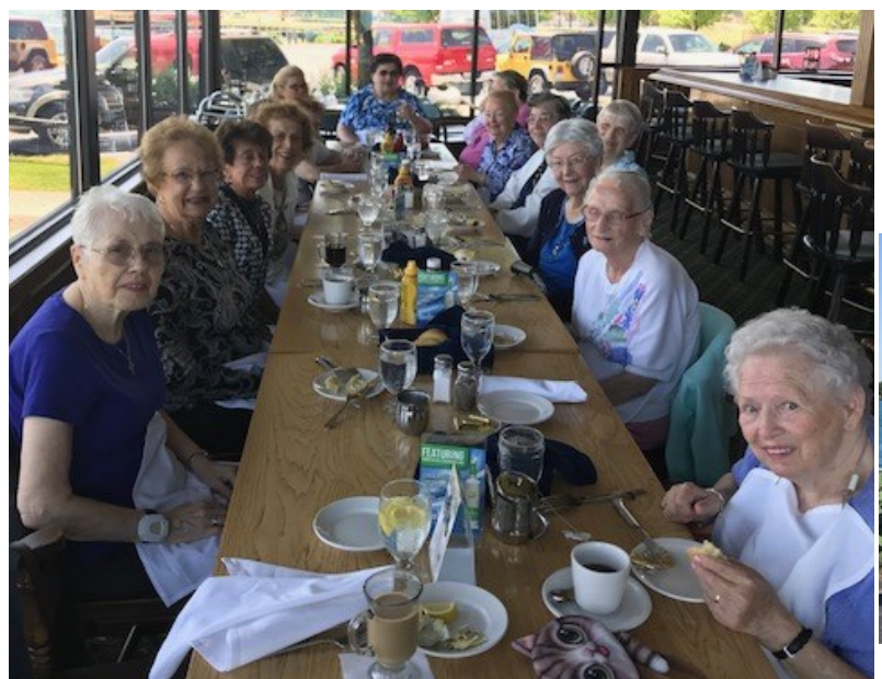
Women's Lunch The Voyager