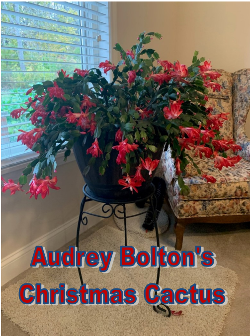
Audrey Bolton's Christmas Cactus